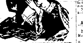
STARR'S CHEMICAL PREPARED GLUE.

FOR FAMILY USE. WILL REPAIR ARTICLES IN WOOD, LEAD, GLASS, PAPER, &c.