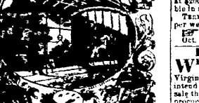
STARR'S CHEMICAL PREPARED GLUE.

FOR FAMILY USE. WILL REPAIR ARTICLES IN WOOD, LEAD, GLASS, PAPER, &c.