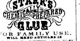
STARR'S CHEMICAL PREPARED GLUE.

NEW ARRANGEMENT. The new arrangement of the Virginia Central R. Road.